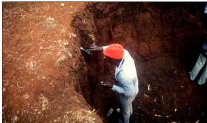
Large numbers of insects collect in brick pits such as this one in Kenya.

Some human activities are particularly conducive to the formation of mosquito habitats, he said, including the traditional method of farming rice in paddies, the use of stagnant ponds to mine clay for brick making and even littering. "Plastic bags are especially disastrous for Africa," according to Dr. ole-MoiYoi. "They are everywhere."