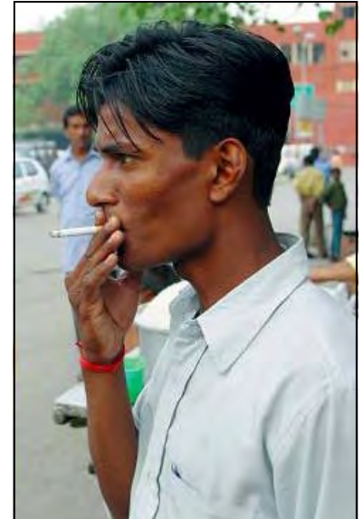
There are about 120 million smokers in India.

Men who smoked cigarettes lost an average of ten years of life, while smoking bidis cut an average of six years from life expectancy. The study found there were no safe levels of smoking. While the hazards of smoking even a few bidis a day raised mortality risks by one-third, consuming the same number of cigarettes nearly doubled the risk of death in middle age.