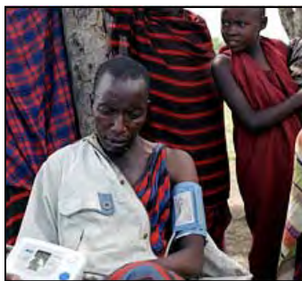
Cardiovascular diseases are a leading cause of death in Africa.