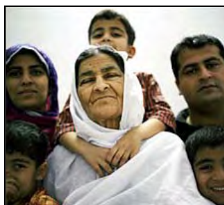
This Syrian woman has lost her leg as a consequence of diabetes.