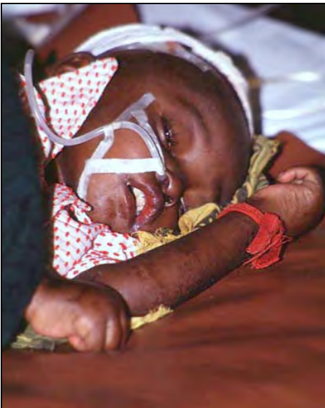
An African child dies of malaria every 30 seconds.

"The extraordinary advances highlighted in this valuable publication reflect a new commitment by the international community to confront malaria with fervor and funding," according to Dr. Fauci. "As a result of recent research, we now have new drugs that are highly effective in treating malaria, new and improved vector control strategies, and a widening pipeline of promising vaccine candidates. Even so, much remains to be done."