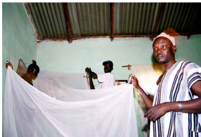
The distribution of insecticide-treated bed nets is a key intervention in malaria control.

Given the disease kills millions and is readily preventable and treatable, the authors encourage the international community to seize the opportunity to reduce massively this human disease burden at such a low cost.