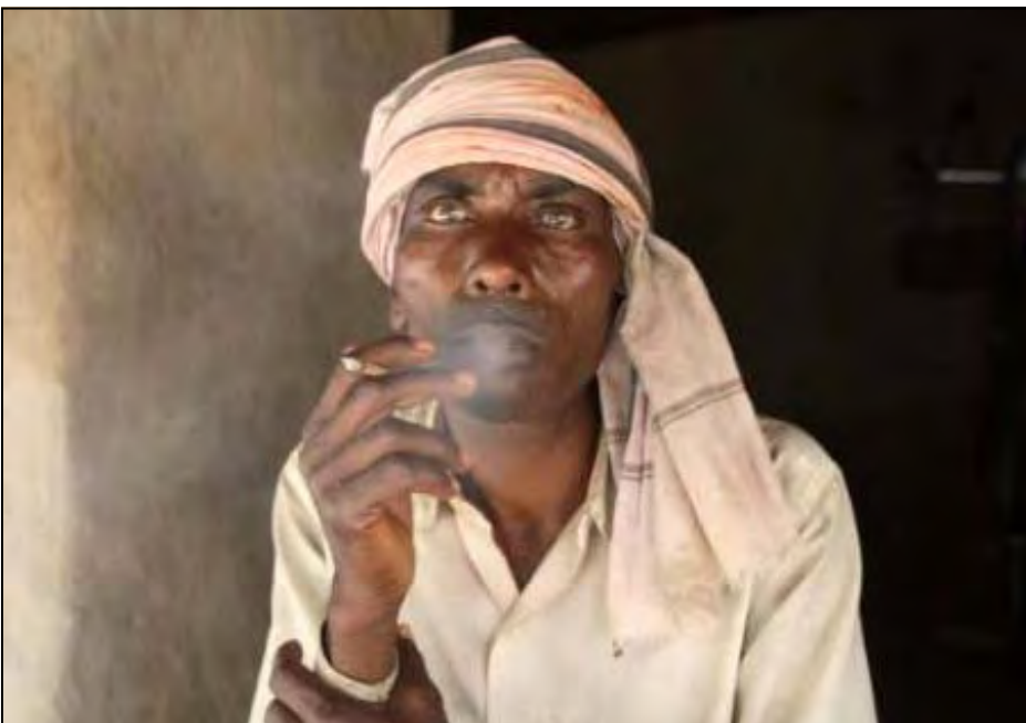
Cheaply made cigarettes known as bidis are inexpensive and popular in India.

"I am alarmed by the results of this study," said India's Health Minister Dr. Abumani Ramadoss. "The government of India is trying to take all steps to control tobacco use—in particular by informing the many poor and illiterate of smoking risks."