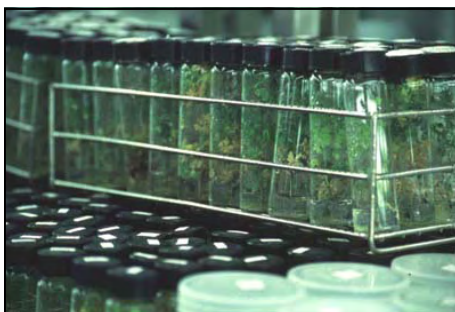
Tissue cultures of Artemisia annua.

Scientists from the University of California at Berkeley are collaborating with private industry and non-profit organizations to improve this situation by producing strains of baker's yeast that can also synthesize the compound. By inserting plant genes into the yeast cells, all of the chemical steps needed to produce artemisinin can be accomplished in a much more efficient